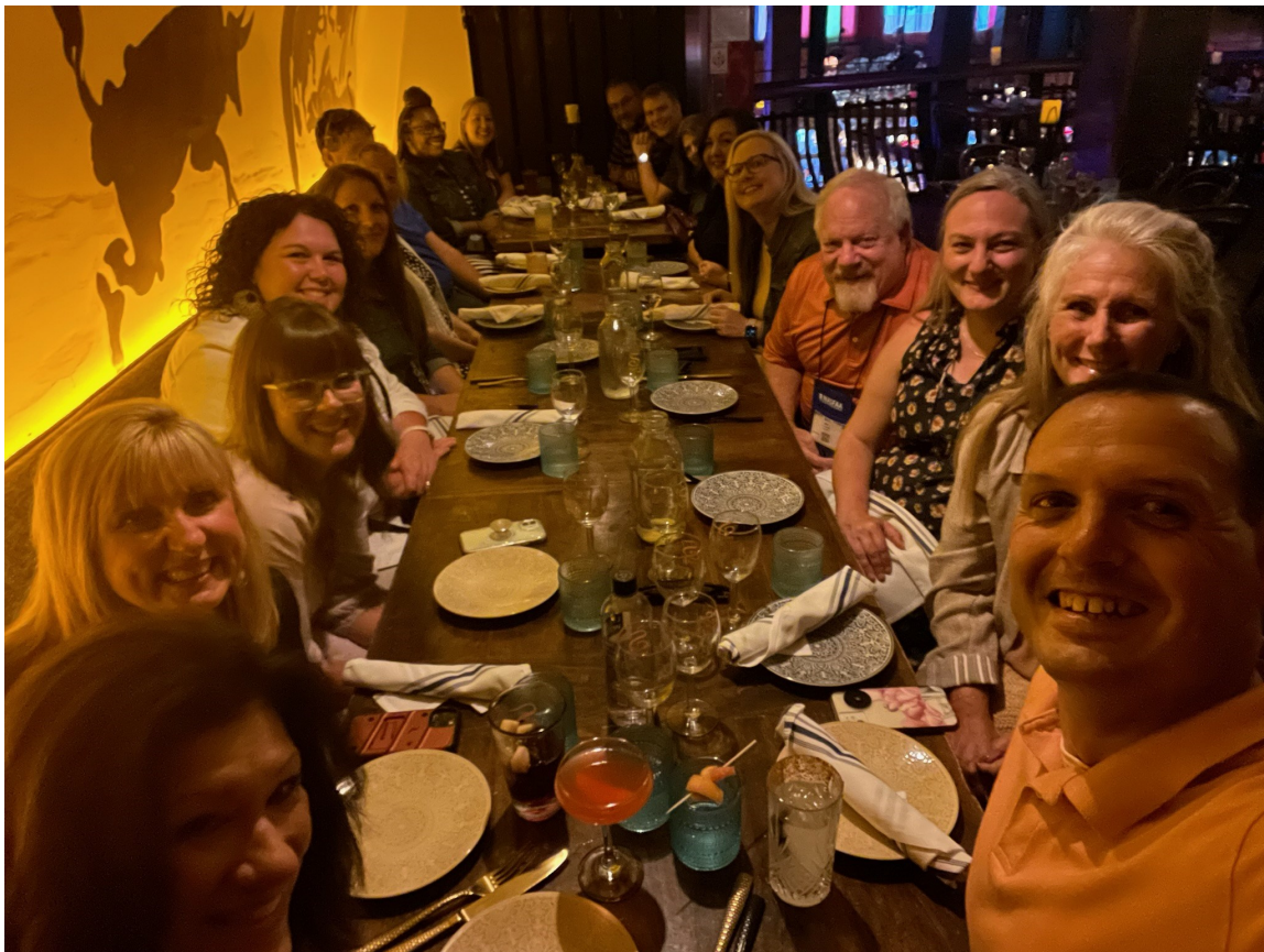
MASFAP members met for dinner in San Diego, California for NASFAA!